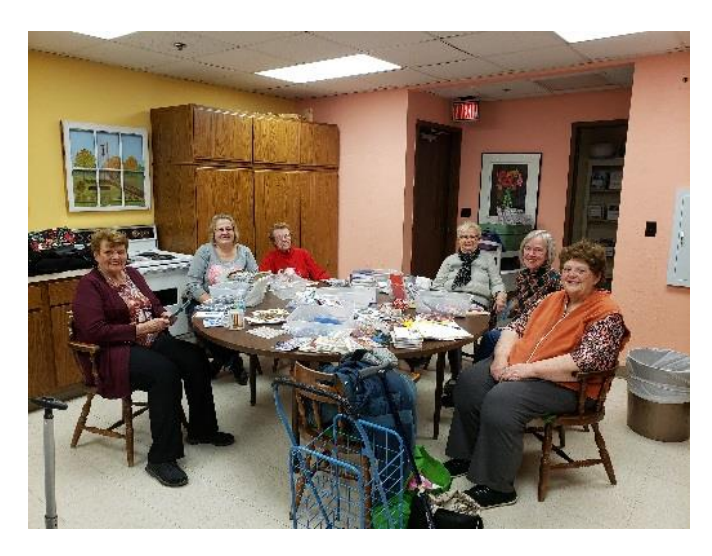
Part of the "Card Crew" preparing for the Christmas Card Sale.

At Illinois Presbyterian Home Communities - Fair Hills Residence, for more than 20 years volunteers have been collecting, sorting, and making greeting cards available for just 10cents each. Most all of the cards are donated, simply ones that were purchased and not used as intended. They are current and beautiful cards ranging from sentimental to humorous.