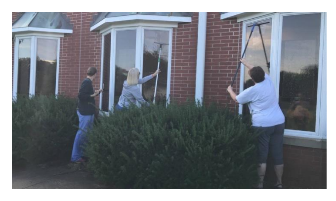
Washing more than 300 windows at Fair Hills Residence assisted living letting even more sunshine in and our residents have even a better view of our scenic 27 acres! Thanks to First Presbyterian Church, Lincoln, IL