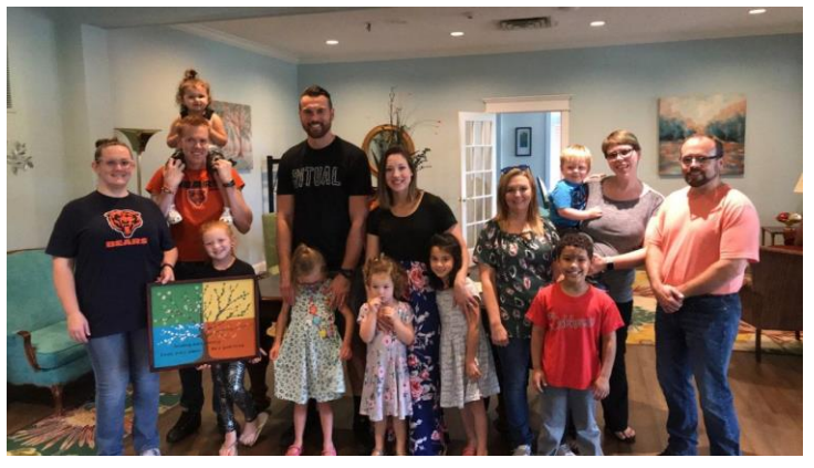
A beautiful new addition to our Activity Room décor!