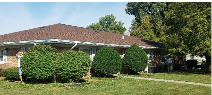
Landscape and outdoor maintenance completed by our friends from First Presbyterian Church, Jacksonville, IL at our independent senior living community located there, DeCastro Apartments.